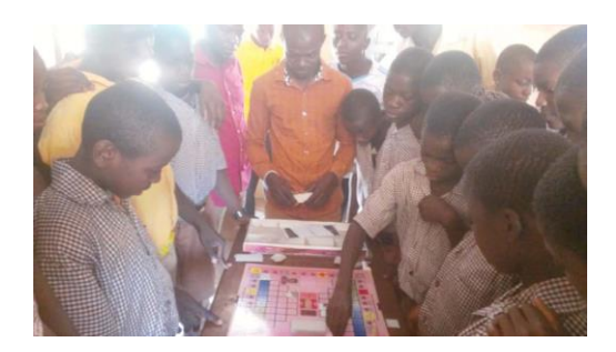
Pupils of Abrewankor JHS Civic Education Club