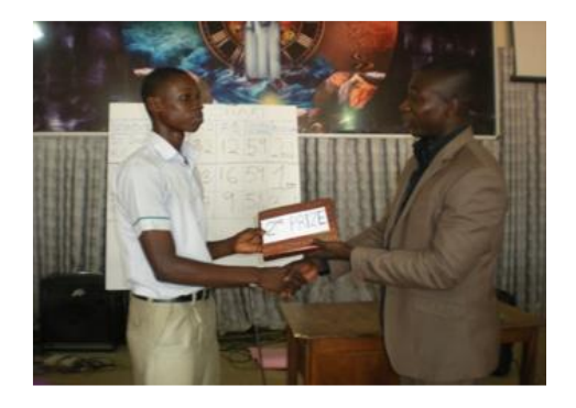
Presentation of the 2<sup>nd</sup> prize at a quiz competition