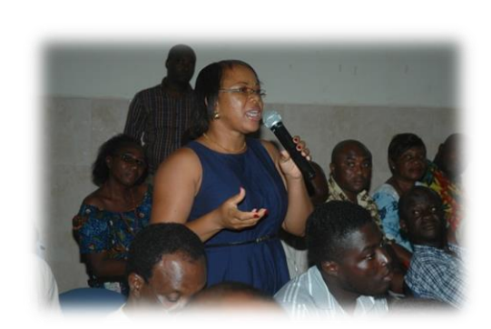
A member of the audience asking a question at the 2^{\mbox{\scriptsize nd}} Dialogue