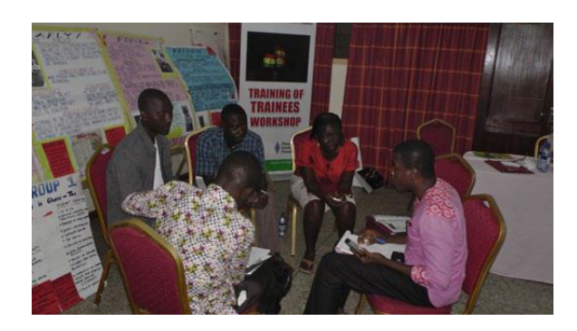
Participants in a group preaparing their porfolio