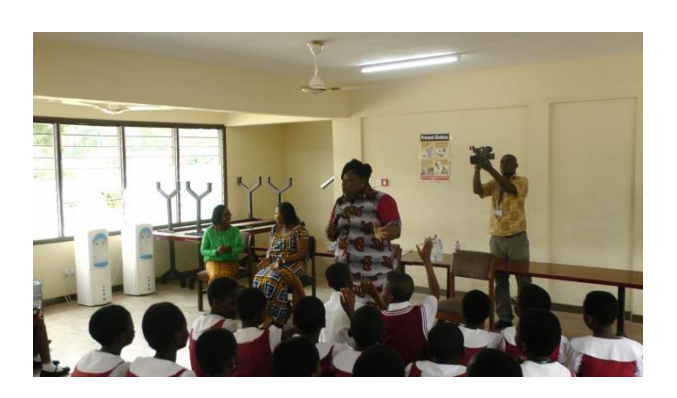
Hon. Nana Oye Lithur, Minister of Gender, Children and Social Protection interacting with pupils of Christ the King School