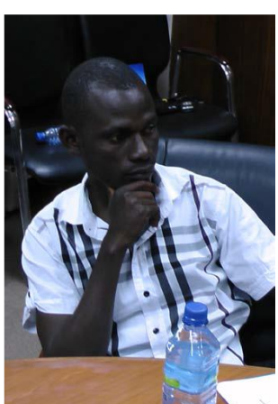
West African Election Observers Network (WAEON) delegation