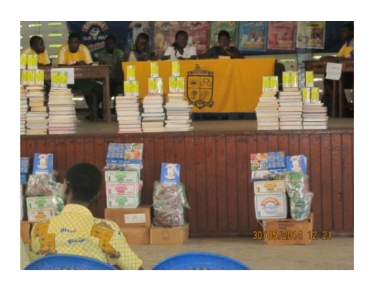
Awards from sponsors for the quiz competition

Quiz Competitions were held at regional and district levels nationwide. Students were awarded branded plaques, books for their school libraries, certificates, souvenirs and food products. Promasidor Ghana Limited and Pens and Plastics Ghana Limited supported some quiz competitions.