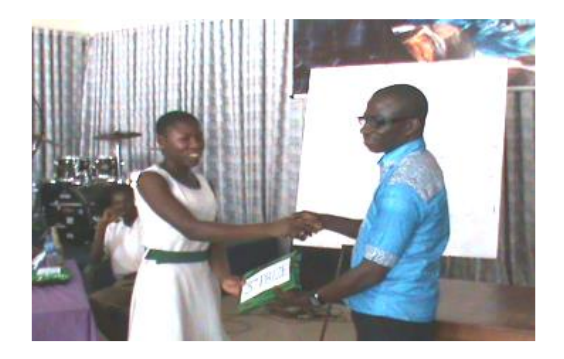
Presentation of the 3<sup>rd</sup> prize at a quiz competition